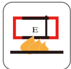
Circuit Integrity IEC 60331-23/BS 6387(Optional)